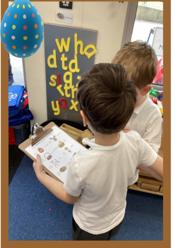
Reception had a great week taking part in lots of Easter activities, making concertina legged chicks, decorating chicks and bunnies and eggs, making nest cakes and using our great investigation skills on an Easter hunt!