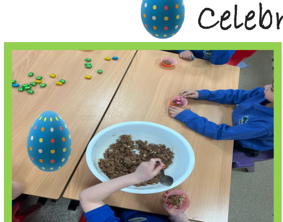
Year 1 had great fun making Easter chocolate nest cakes this week. They were scrumptious!