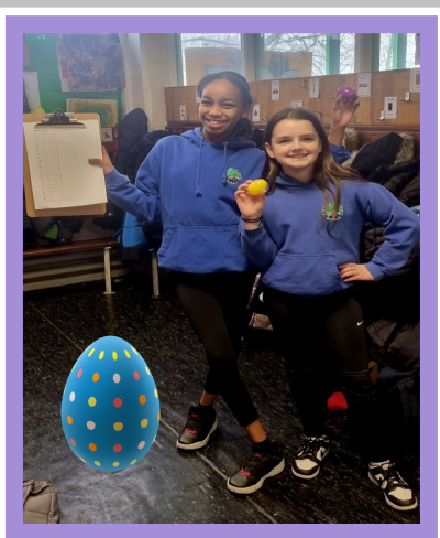
Year 6 have had great fun during booster. They completed an Easter egg hunt with a twist - solving arithmetic questions! Lots of maths and running around.