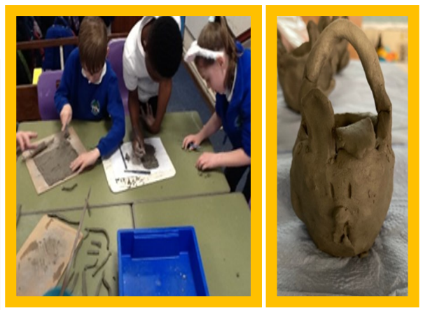
We have had a lot of fun shaping clay this week in Year 2 . We have used tools to add patterns in relief and to stick on shapes using the score and slip method.

In our D&T unit the children in Year 3 assembled paper nets to create a 3D castle.