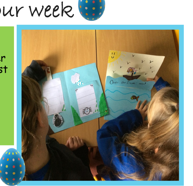
Year 5 have been creating a pop-up story book for Year 1 pupils, with a mechanism to make them interactive.