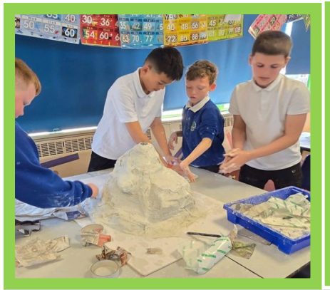
Year 6 have had great fun designing and making their own mountains using Modroc. They have thought carefully about the type of mountain they will create and also how they are going to incorporate the key features of a mountain. Keep your eyes peeled for their finished versions!