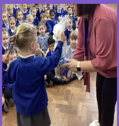
levers and linkages to create moving monsters. Well done to all the Nursery winners for our easter raffle! Thankyou for buying tickets and helping us raise money.

Year 3 have been learning about the life cycle ofa flower and acted out the different stages they go through.